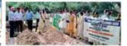
ਅਕਾਲ ਯੂਨੀਵਰਸਿਟੀ ਨੇ ਬਾਗਵਾਨੀ ਵਰਕਸ਼ਾਪ ਕਾ ਕਿਆ ਆਯੋਜਨ।

ਅਕਾਲ ਯੂਨੀਵਰਸਿਟੀ ਨੇ ਬਾਗਵਾਨੀ ਵਰਕਸ਼ਾਪ ਕਾ ਕਿਆ ਆਯੋਜਨ। ਇਸ ਵਰਕਸ਼ਾਪ ਵਿੱਚ ਬਾਗਵਾਨੀ ਵਰਕਸ਼ਾਪ ਕਾ ਕਿਆ ਆਯੋਜਨ।