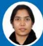
BHAWNA AIR- 128 (NET) Nov-2020 Botany