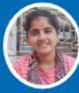
DEEPAI JRF, Dec-2021 Commerce