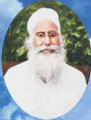
Saint Attar Singh Ji (1866-1927)

The great visionary of 20 th century (Sant Attar Singh ji) had a vision that modern scientific education alone will not serve the humanity well, until and unless it is amalgamated with Brahm Vidya (Spiritual Education)