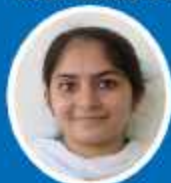
ALIZA Physical Research Lab Ahmedabad, Physics

Homi Bhabha Centre for Science Education, Tata Institute of Fundamental Research Mumbai