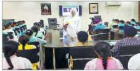
ਵਿਦਿਆਰਥੀਆਂ ਨੂੰ ਫਿਜ਼ੀਅਲ ਡਾਕਟਰੀ ਦੇ ਮਹੱਤਵ ਬਾਰੇ ਪੰਜਾਬੀ ਆਰਥੀਆਂ ਨੂੰ ਸੁਣਾਉਣ ਲਈ।

ਸੁਨੀਆਂ ਵਿਚ ਲੜ ਤੋਂ ਵੀ ਪੰਜਾਬ ਵਾਟ ਪੰਜਾਬੀ ਅਖਬਾਰ