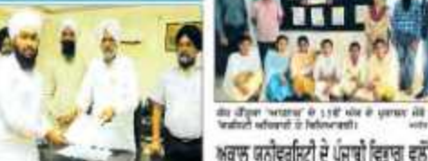
ਅਕਾਲ ਯੂਨੀਵਰਸਿਟੀ ਦੇ ਪੰਜਾਬੀ ਵਿਦਿਆਰਥੀਆਂ ਦੀ ਨੌਕਰੀ ਲਈ ਚੋਣ ਹੋਈ।

ਦੇਸ਼ ਵਿੱਚ ਸਦਾਚਾਰਕ ਕਦਰਾਂ-ਕੌਮਤਾਂ ਦੀ ਖੋਜ ਅਤੇ ਸੁਰੱਖਿਆ ਨੂੰ ਉਤਸ਼ਾਹਿਤ ਕਰਨ ਲਈ ਅਕਾਲ ਯੂਨੀਵਰਸਿਟੀ ਵਿਖੇ ਸਦਾਚਾਰਕ ਕਦਰਾਂ-ਕੌਮਤਾਂ 'ਤੇ ਆਧਾਰਿਤ ਵਿਸ਼ੇਸ਼ ਪ੍ਰੋਗਰਾਮ ਦੀ ਸ਼ੁਰੂਆਤ ਕੀਤੀ ਗਈ। ਇਸ ਪ੍ਰੋਗਰਾਮ ਵਿੱਚ ਸਦਾਚਾਰਕ ਕਦਰਾਂ-ਕੌਮਤਾਂ ਦੀ ਖੋਜ ਅਤੇ ਸੁਰੱਖਿਆ ਨੂੰ ਉਤਸ਼ਾਹਿਤ ਕਰਨ ਲਈ ਅਕਾਲ ਯੂਨੀਵਰਸਿਟੀ ਵਿਖੇ ਸਦਾਚਾਰਕ ਕਦਰਾਂ-ਕੌਮਤਾਂ 'ਤੇ ਆਧਾਰਿਤ ਵਿਸ਼ੇਸ਼ ਪ੍ਰੋਗਰਾਮ ਦੀ ਸ਼ੁਰੂਆਤ ਕੀਤੀ ਗਈ। ਇਸ ਪ੍ਰੋਗਰਾਮ ਵਿੱਚ ਸਦਾਚਾਰਕ ਕਦਰਾਂ-ਕੌਮਤਾਂ ਦੀ ਖੋਜ ਅਤੇ ਸੁਰੱਖਿਆ ਨੂੰ ਉਤਸ਼ਾਹਿਤ ਕਰਨ ਲਈ ਅਕਾਲ ਯੂਨੀਵਰਸਿਟੀ ਵਿਖੇ ਸਦਾਚਾਰਕ ਕਦਰਾਂ-ਕੌਮਤਾਂ 'ਤੇ ਆਧਾਰਿਤ ਵਿਸ਼ੇਸ਼ ਪ੍ਰੋਗਰਾਮ ਦੀ ਸ਼ੁਰੂਆਤ ਕੀਤੀ ਗਈ।